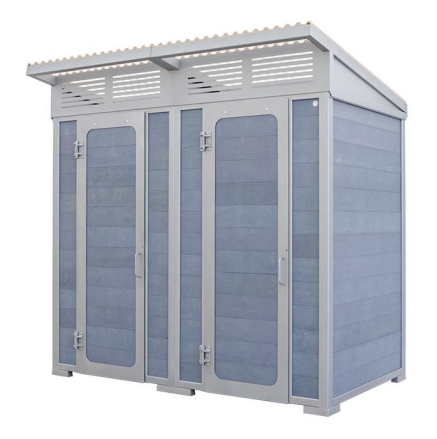
FOREST DOUBLE [96" W x 55" D]