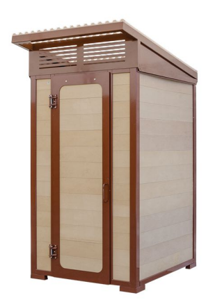
FOREST REGULAR [48" W x 55" D]