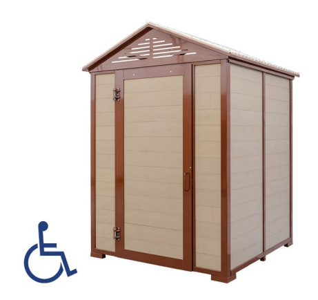
JOHN ADA COMPLIANT [68" W x 80" D] JOHN JUMBO [68" W x 68" D]