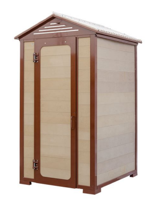
JOHN REGULAR [48" W x 55" D]