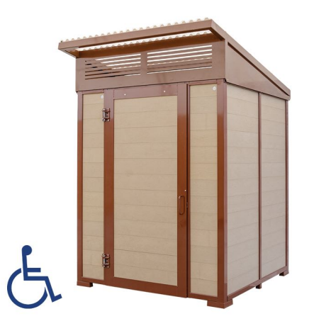
FOREST ADA COMPLIANT [68" W x 80" D] FOREST JUMBO [68" W x 68" D]